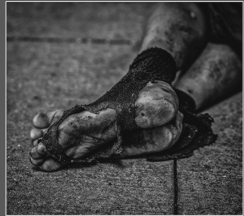
Below: Worn Socks by Sal Patalano part of "One Race, One Face"