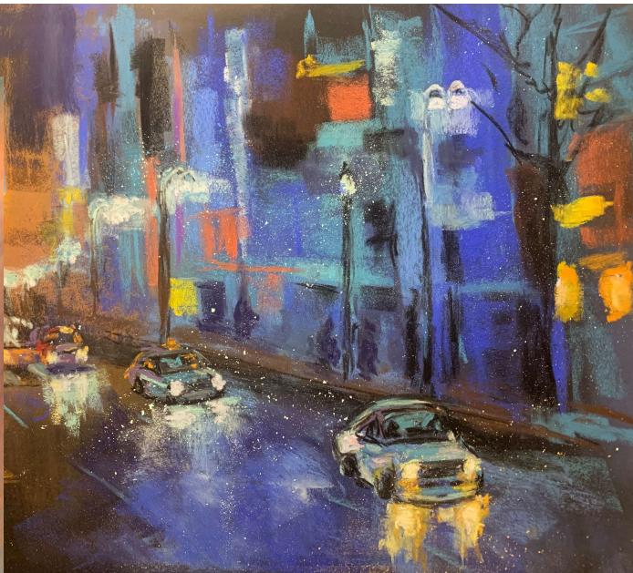
Paris Lights by Willow Wright