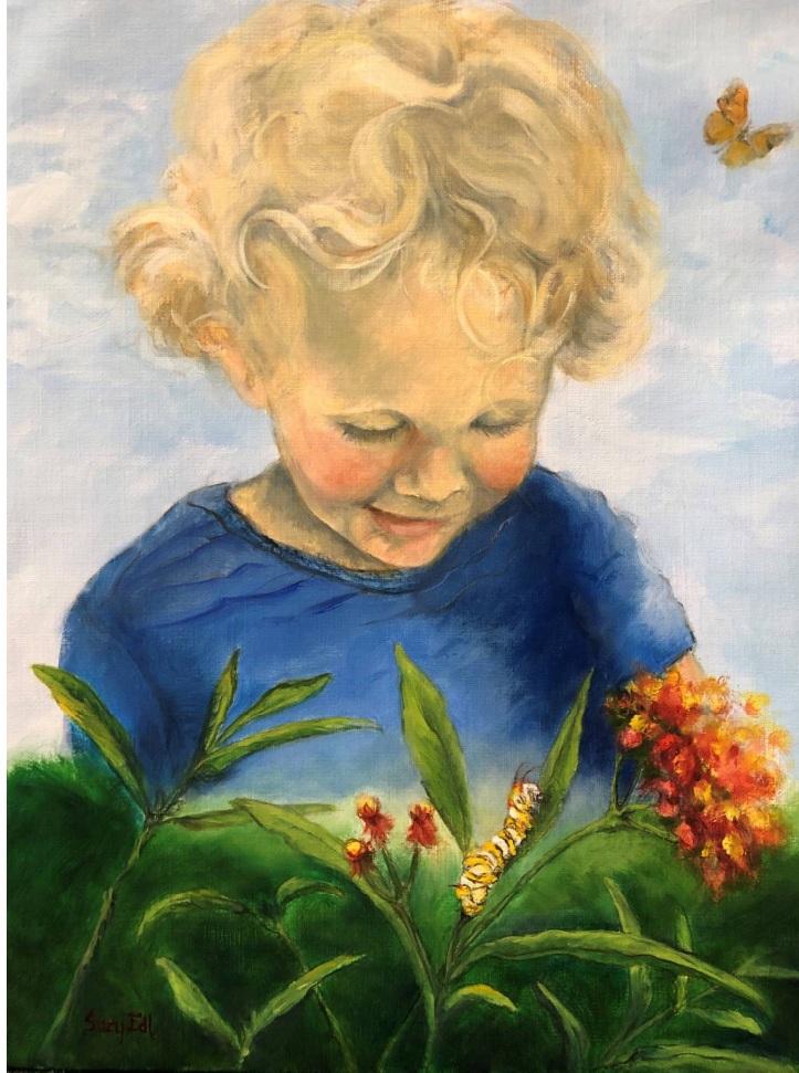
"Anticipation" by Suzy Edl